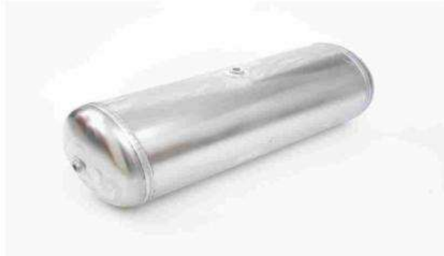
Reservoir 125 ltr