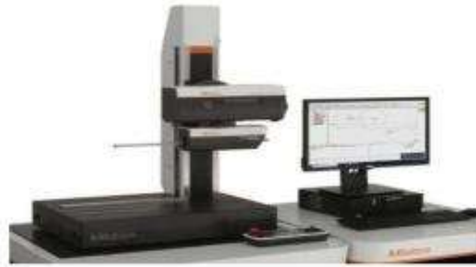
MITUTOYO CONTOUR TRACER