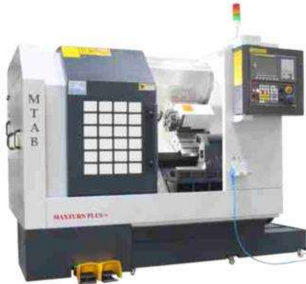
TURNING CENTER- 20 Nos