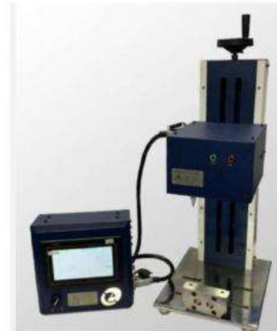
PIN MARKING MACHINE