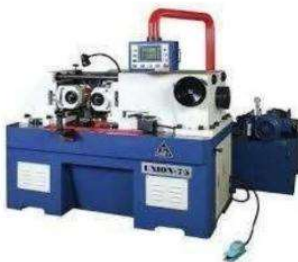
THREAD ROLLING MACHINE