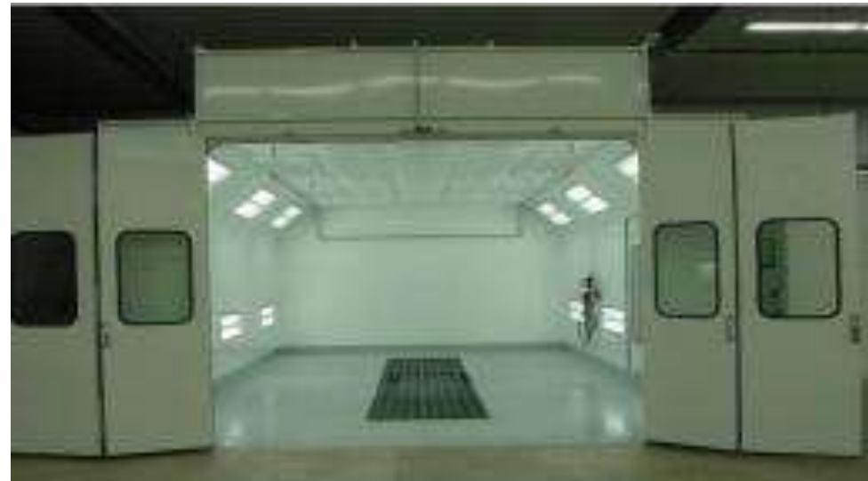
OVEN 60 HP