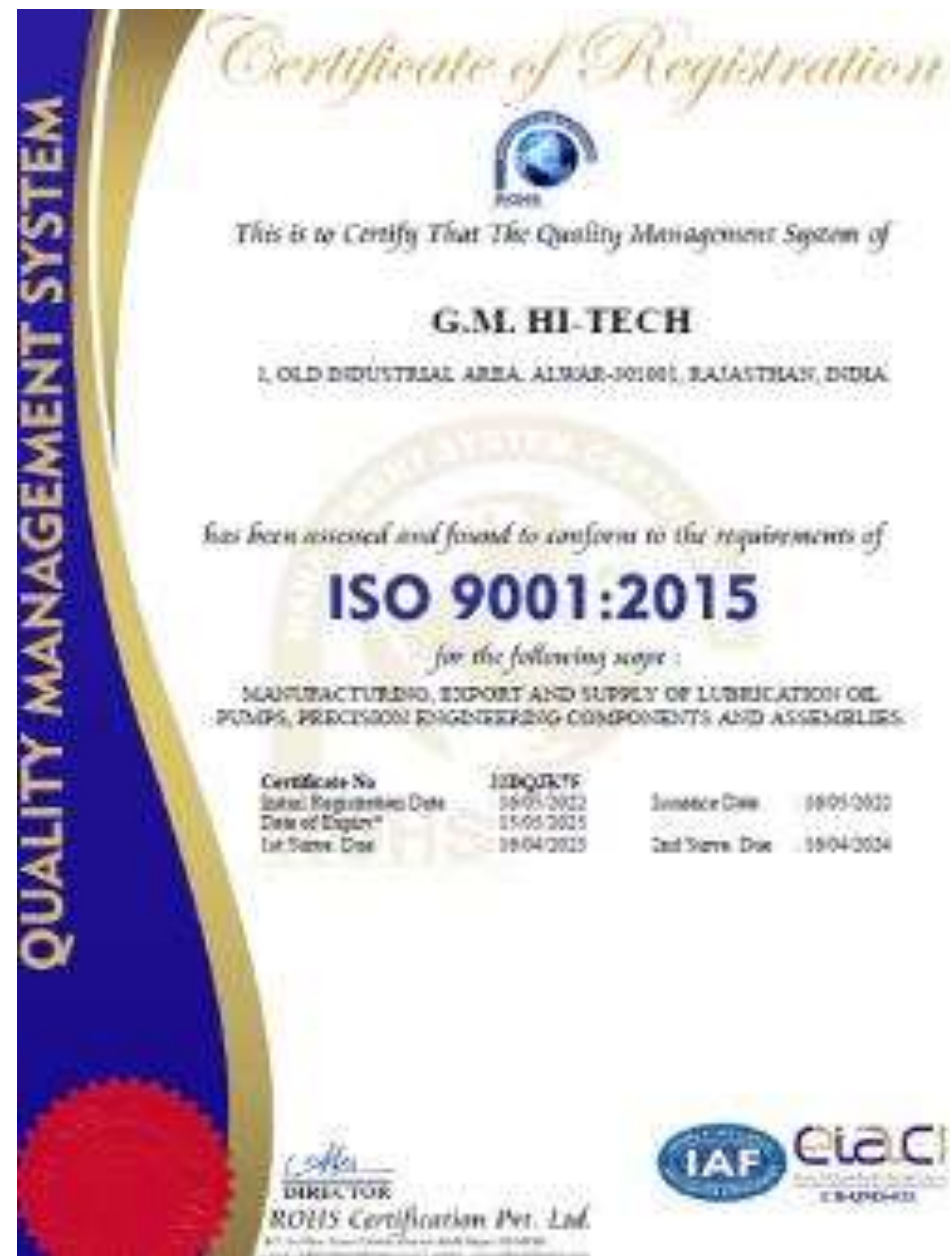
UNIT 1- MACHINING PLANT