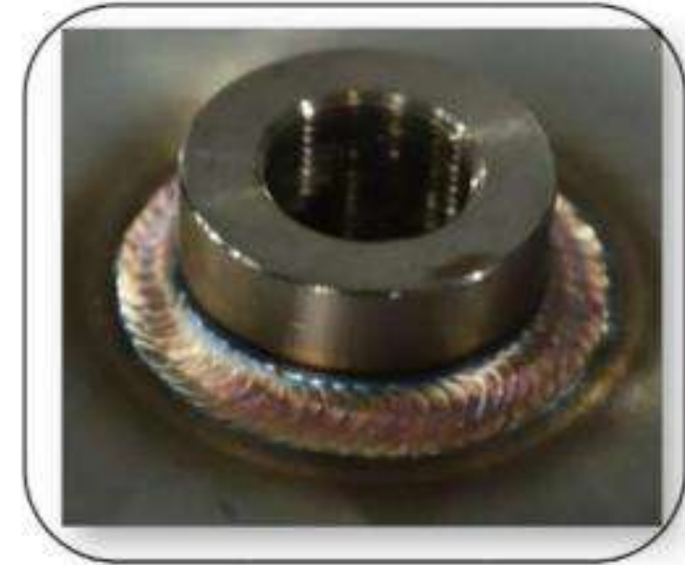
SS Bush TIG Welding