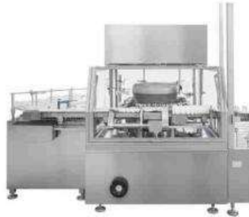
JET CLEANING MACHINE