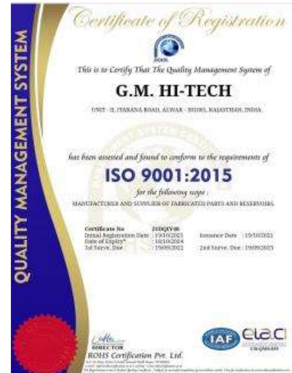
UNIT 2- FABRICATION PLANT