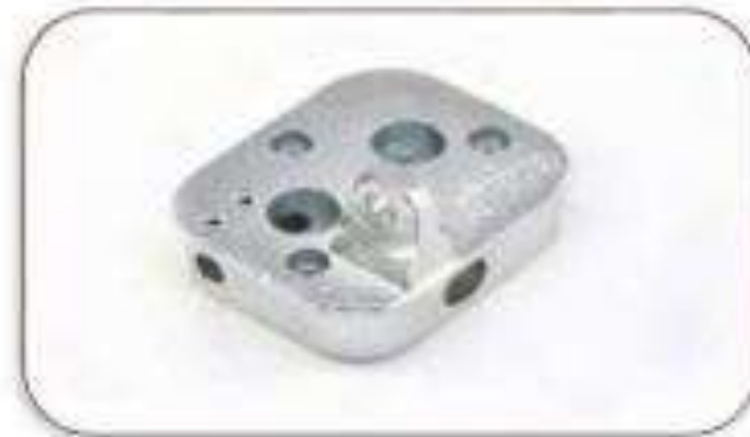
FRONT & REAR COVERS