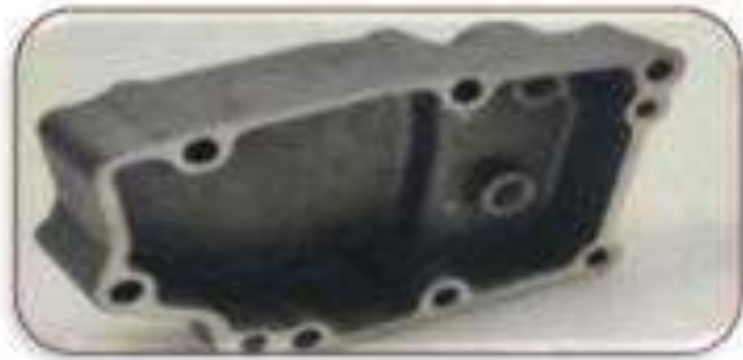
ROCK SHAFT CONTROL COVER