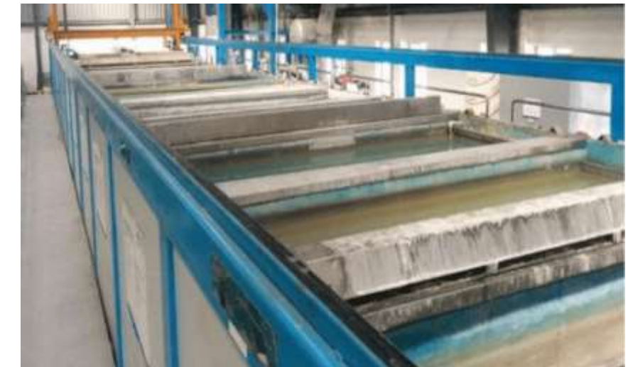
PICKLING & PASSIVATION