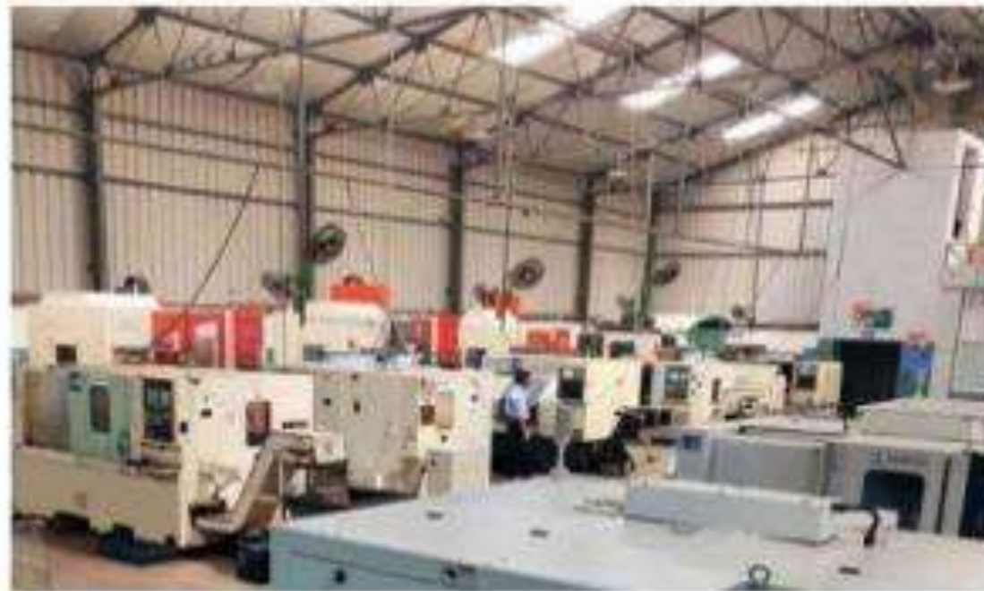
PRECISION MACHINING AND PUMP ASSEMBLY SHOP

Plant area : 2700 Square Yard Constructed area : 36000 Square feet