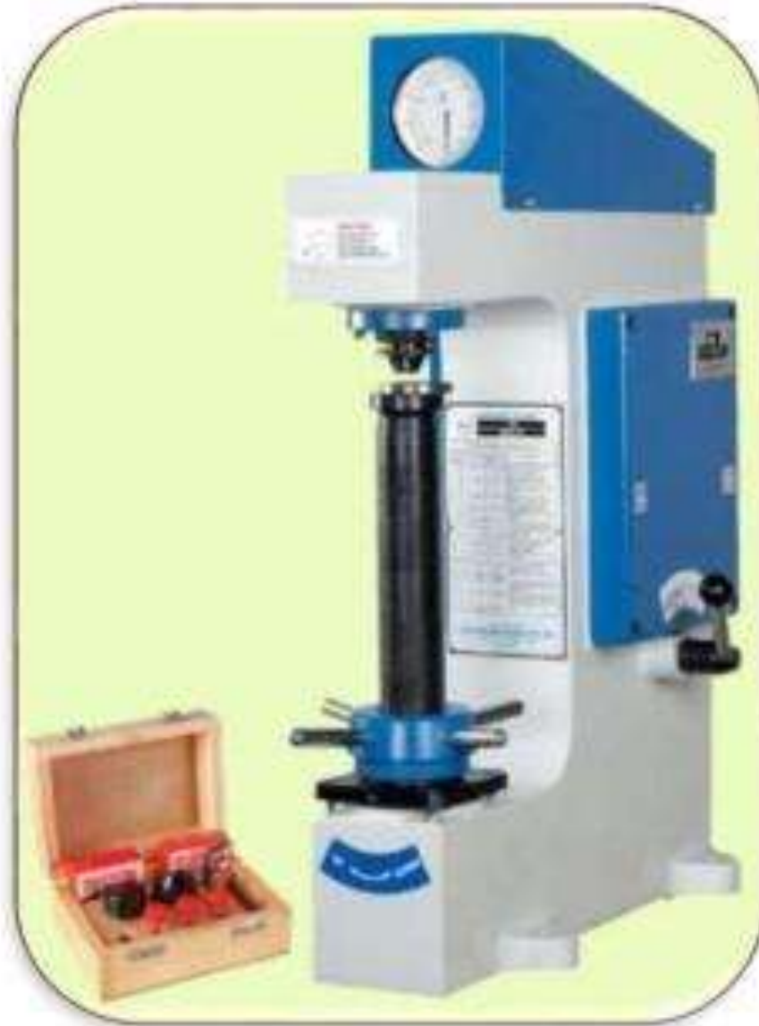
ROCKWELL HARDNESS TESTER