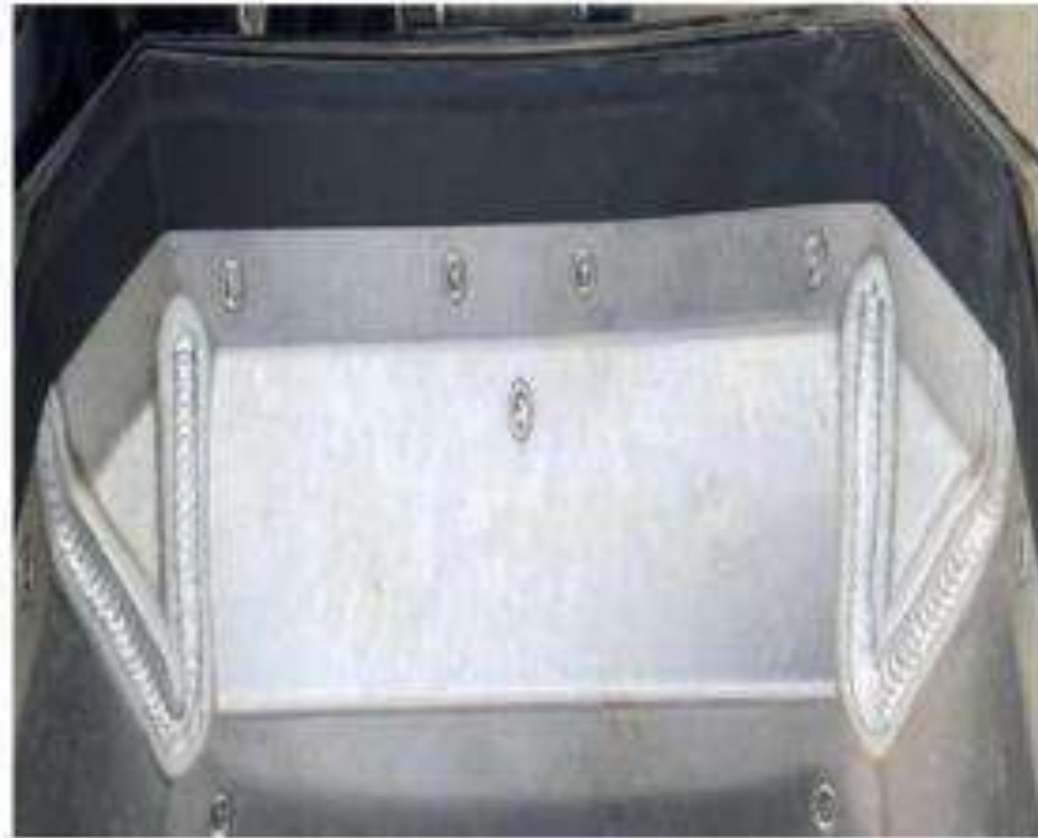
Aluminium TIG Welding