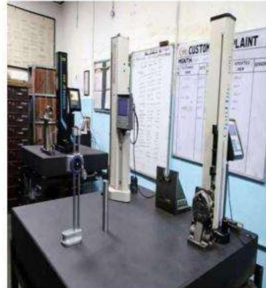
Height Master (Electronic Optima-600mm-3NOS