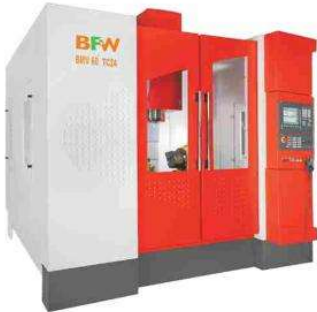
VMC -25 Nos