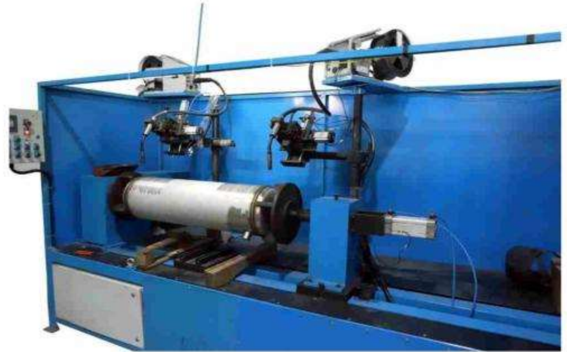
Circular Welding SPM