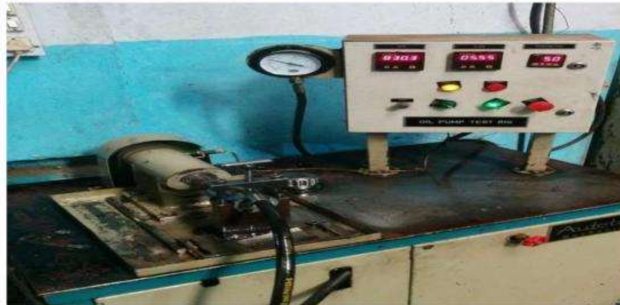
Test Rig for LOF Pump –03 nos ( Lubrication Gear Oil Pumps Assembly)