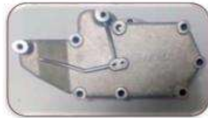
COVER ROCKSHAFT VALVE