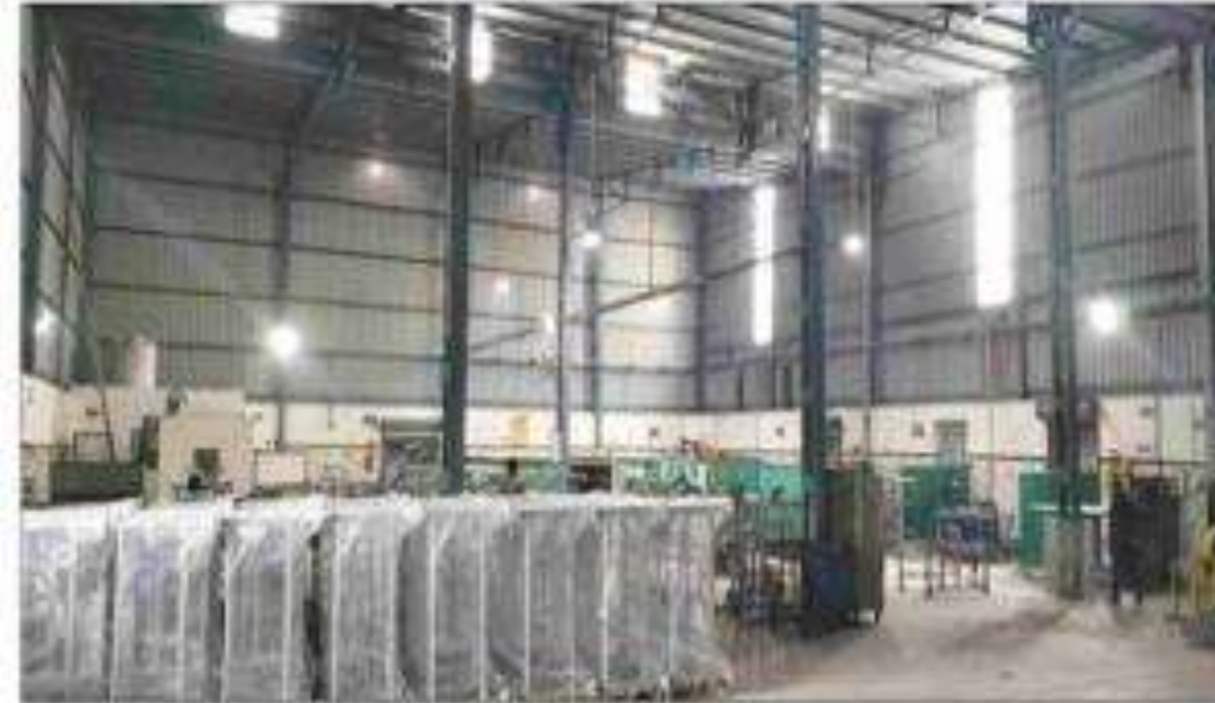
LASER CUTTING & STAINLESS STEEL FABRICATION

Plant area : 2300 Square Yard Covered area : 25000 Square Feet