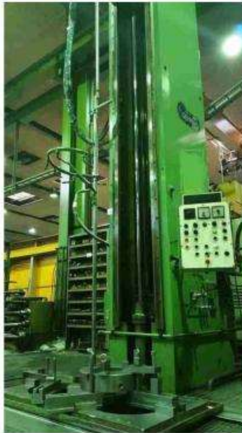
GEHRING- HONING MACHINE