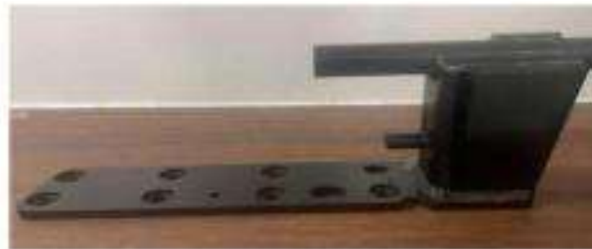
DOOR LEAF CARRIER