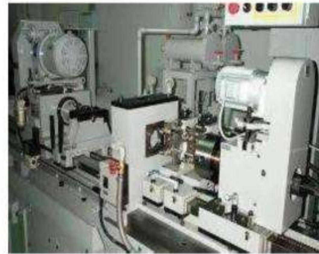
GUN DRILL MACHINE