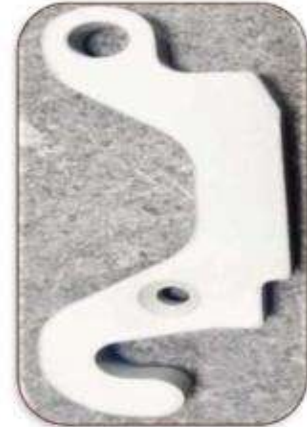
LASER CUTTING- LOCKING GATE