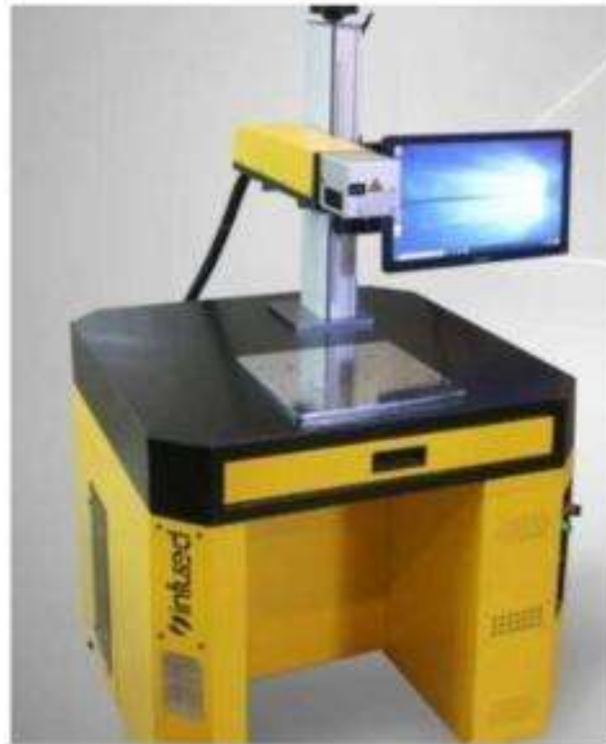
LASER MARKING MACHINE