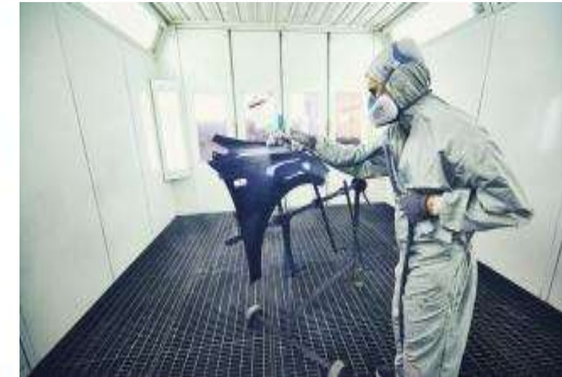
SPRAY PAINT BOOTH