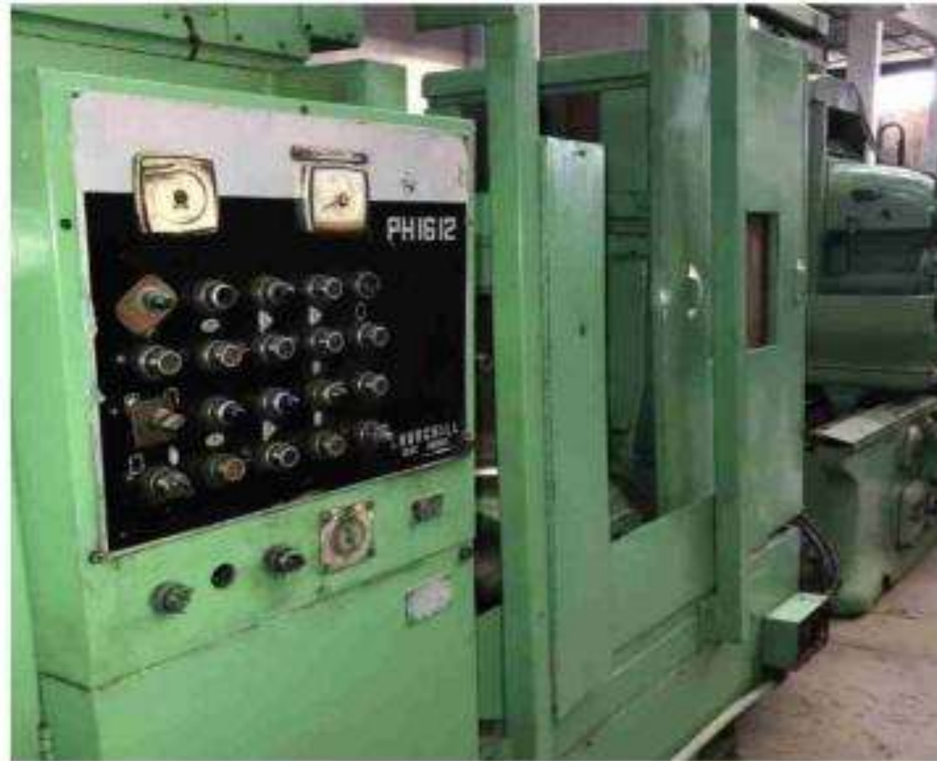
HOBGING MACHINES – HURTH & CHURCHILL MAKE