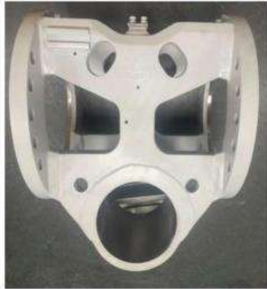
AXLE BODY 60Kg