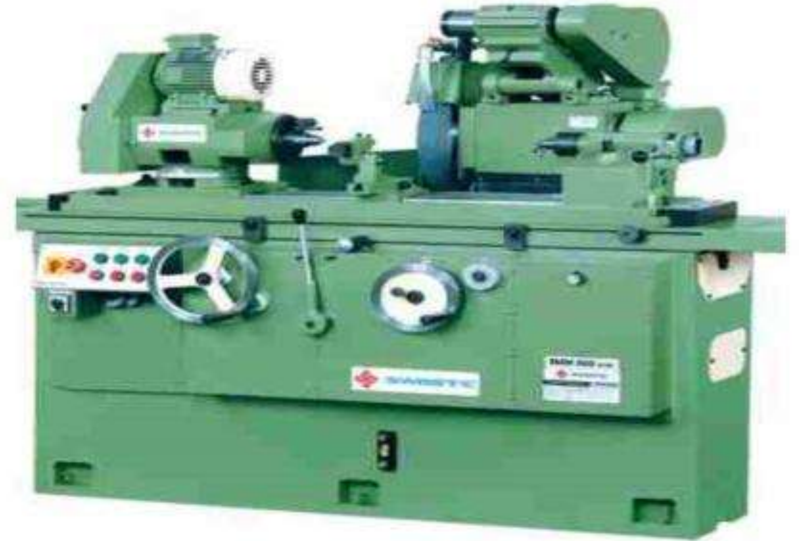
CYLINDRICAL & ANGULAR GRINDER- ScCHAUDTH & WMN MAKE