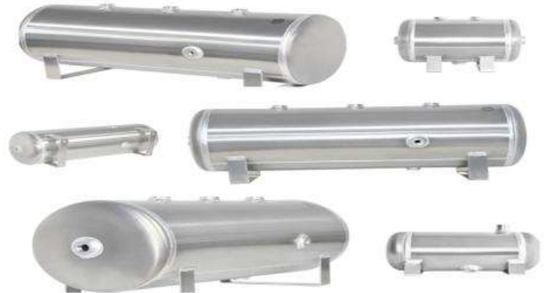
SS AIR RESERVOIR 0.3 Liters TO 125 Liters