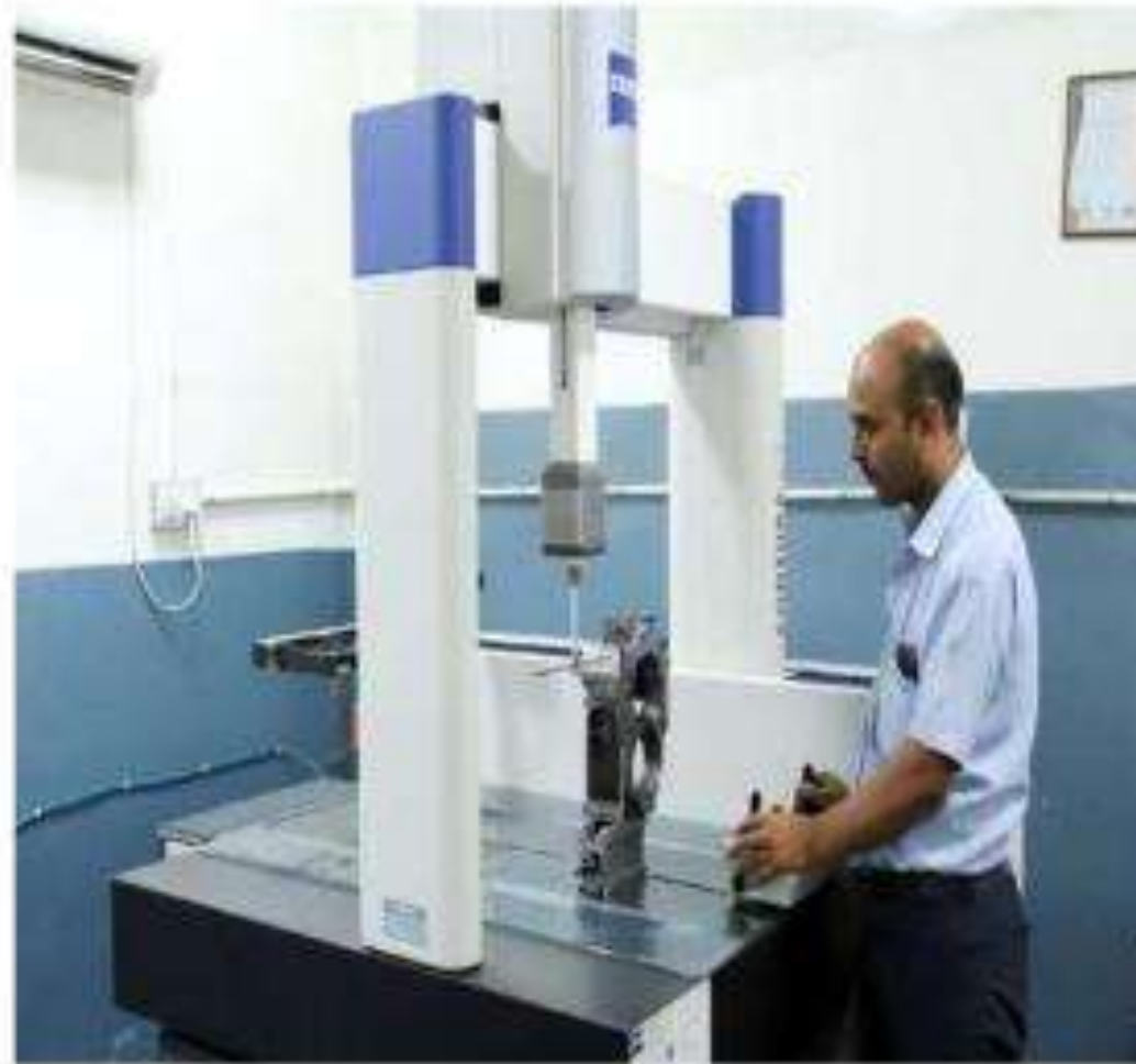
Co-ordinates Measuring Machine (Carl Zeiss)- 700X1000X600mm