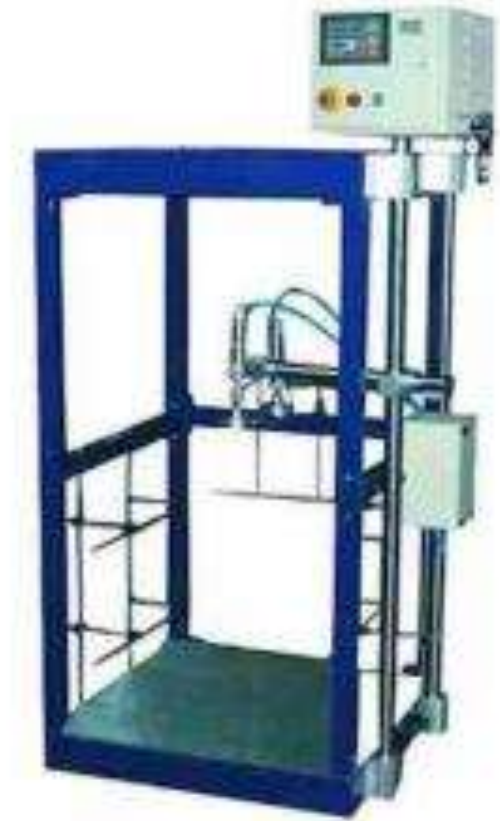
LEAK TESTING MACHINE