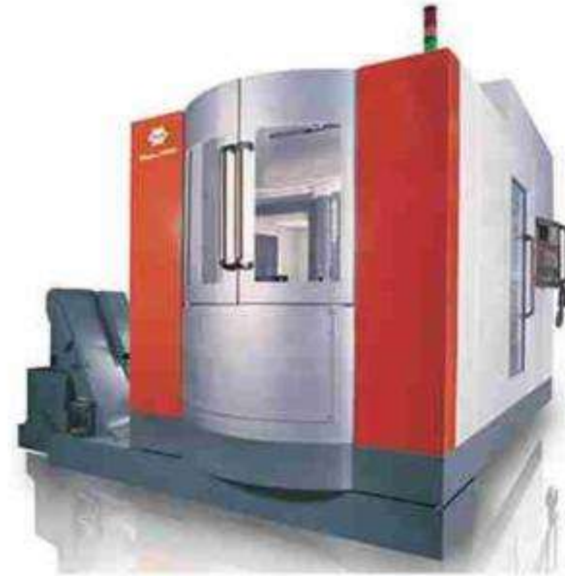
HMC- 4 Nos