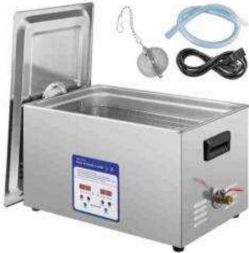
ULTRASONIC CLEANING MACHINE