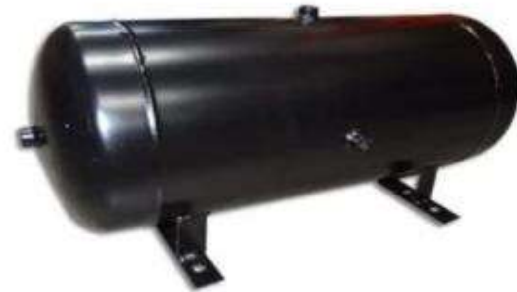
Reservoir 100 ltr