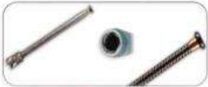
4 START ACME THREAD - SCREW & NUT