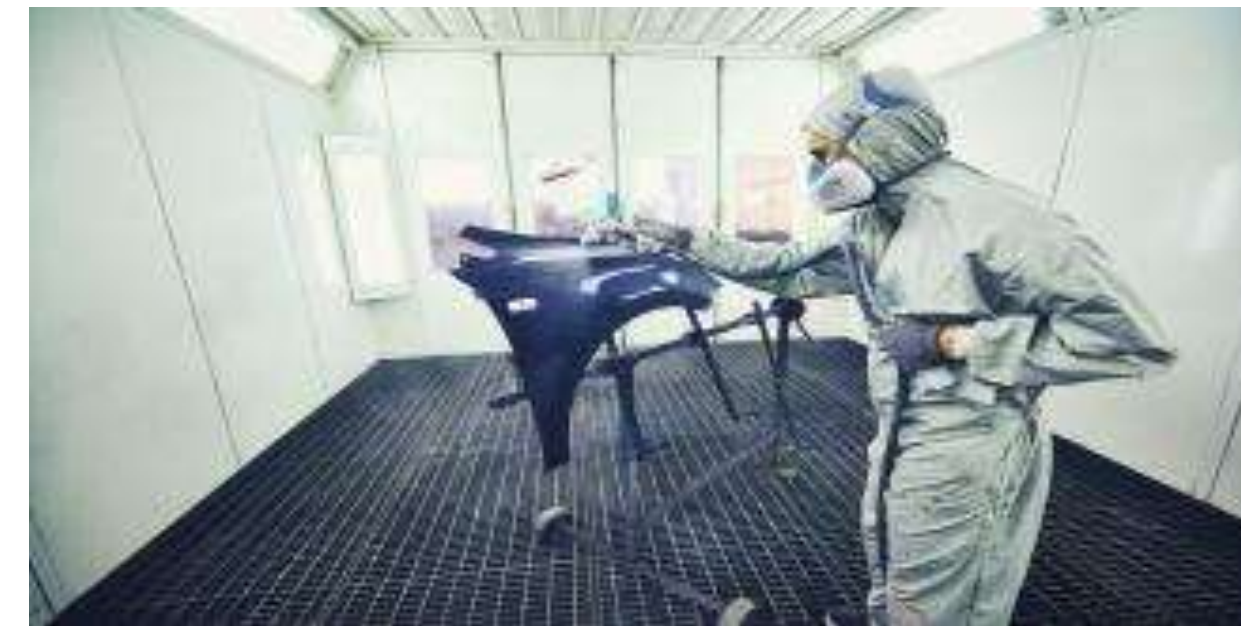
MILD STEEL FABRICATION & PAINT SHOP

Plant area : 2300 Square Yard Covered area : 25000 Square Feet