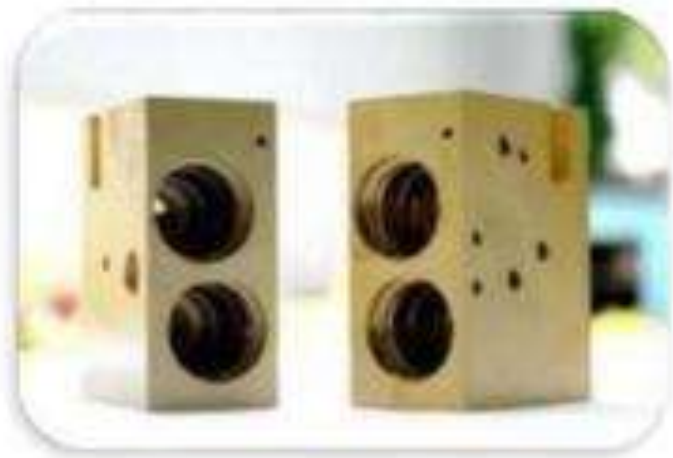
ANODIZED ALUMINUM HOUSINGS