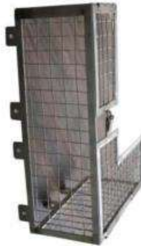
FRONT COVER MESH