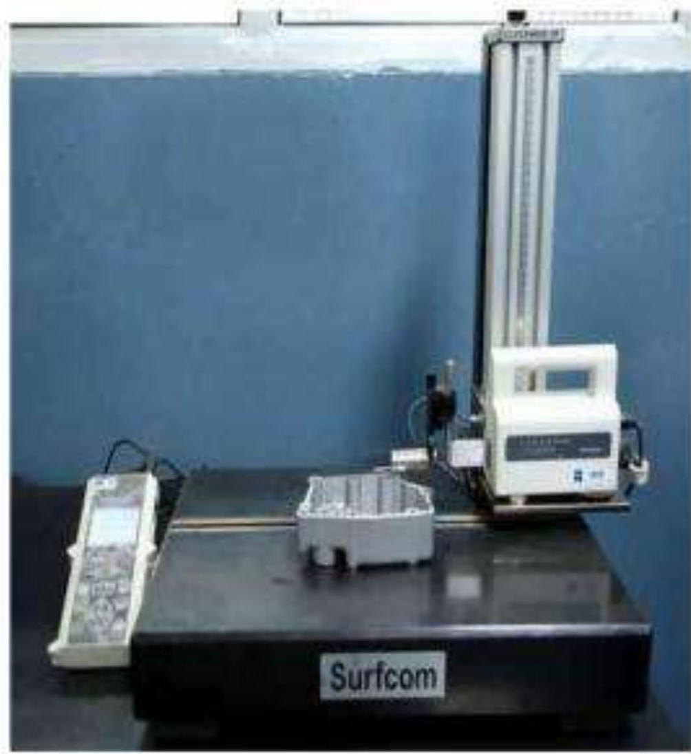
CARL ZEISS ROUGHNESS TESTER