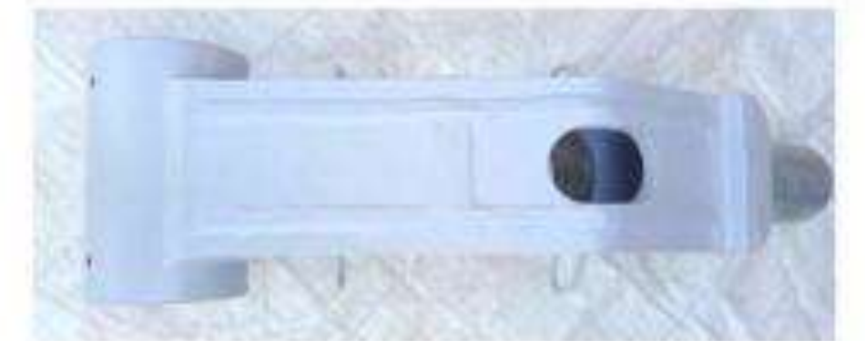
ROCKER ARM 80 Kg

MS (Structural Steel) FABRICATION FOR TRAILOR