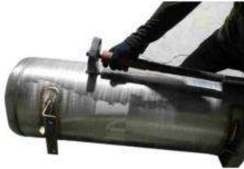
BUFFING & POLISHING