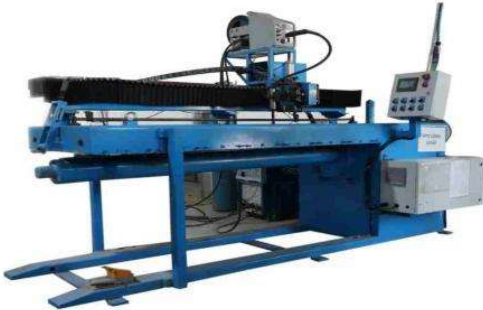
Linear Welding SPM