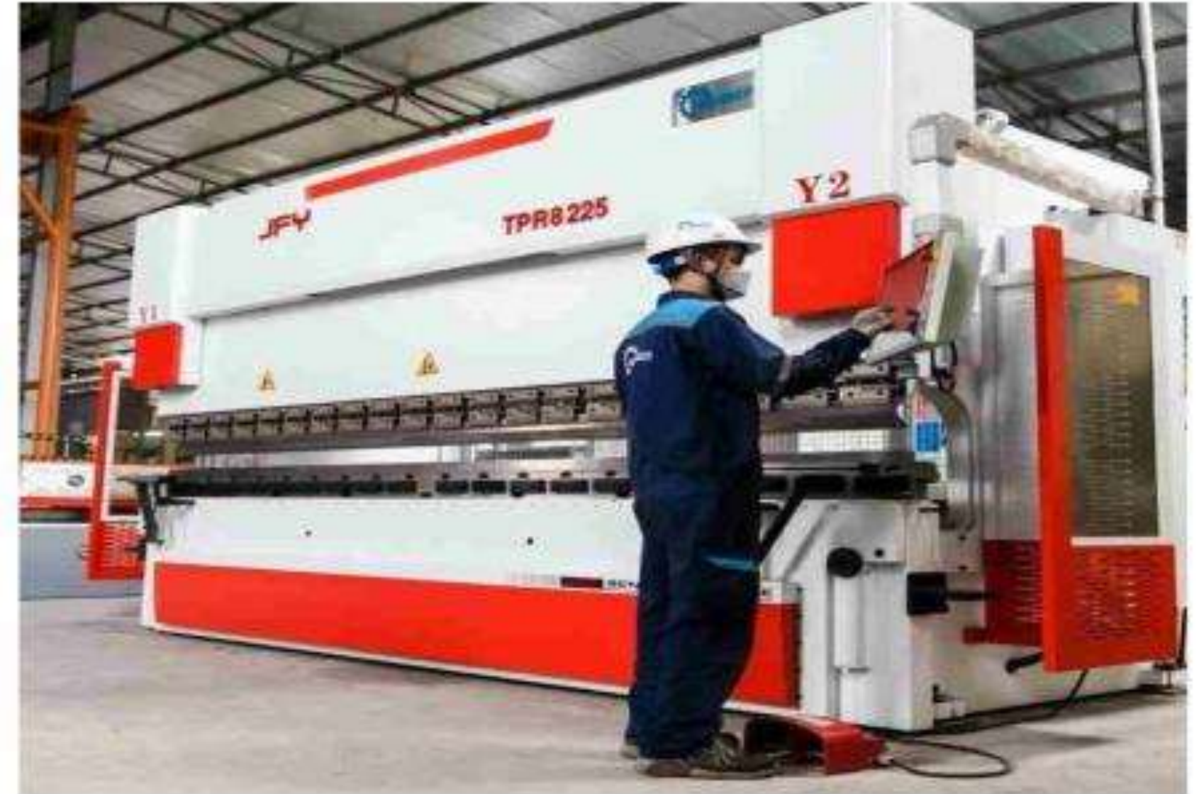
CNC PRESS BRAKE 225 TONS, 4mtr