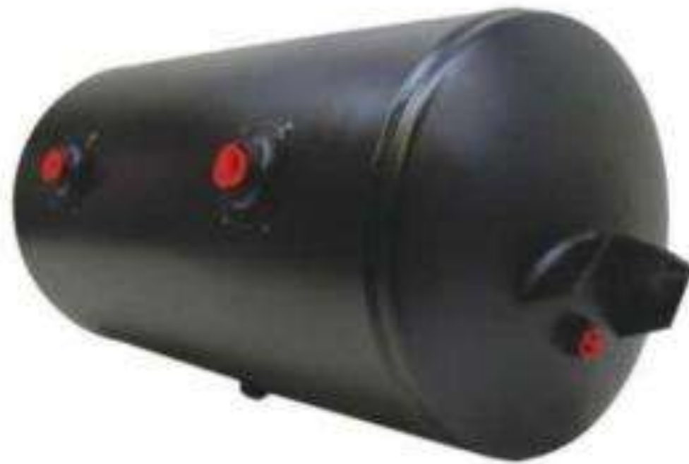
Reservoir 20 Ltr