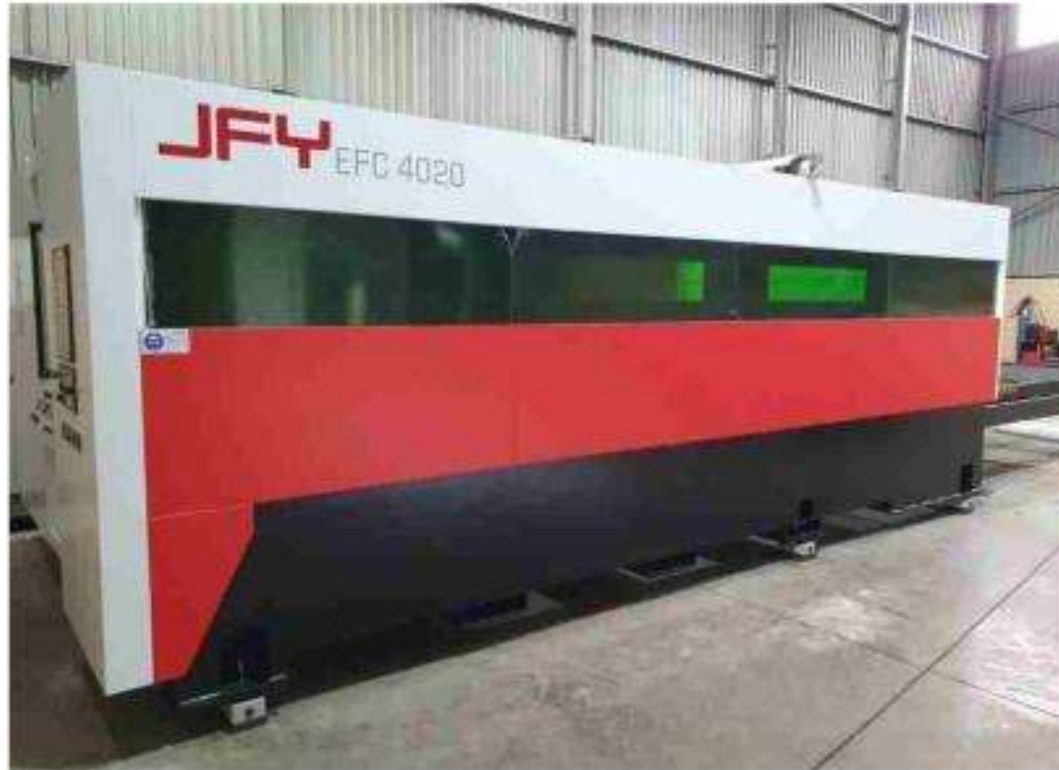
LASER CUTTING 6 KW, 4mtr x 2mtr